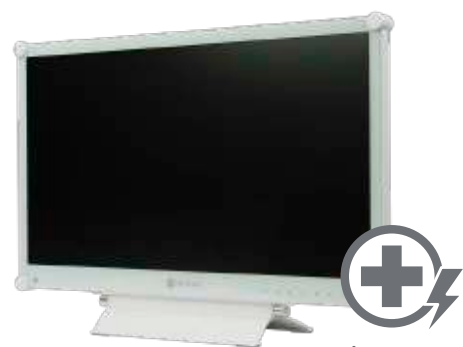
IEC/EN 60601-1 Medical-Grade Power Supply

The MX-Series adopts a specially designed low-voltage medical-grade power supply to ensure safety, performance, and reliability in any professional medical environment. Compliance with the IEC/EN60601-1 standards ensures their safe and reliable performance in demanding medical settings.