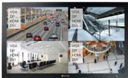
Multi-screen viewer allows all 4 signal sources being displayed in 4 screens simultaneously.